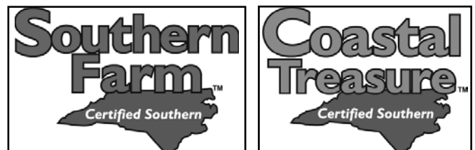
Fig. 1: Southern Farm uses two different logos to market its farm and seafood products.

A logo is an identifying symbol or image that complements the brand name. The hallmark of a logo design is simplicity – less is always more. The simpler a design appears, the more likely it is to attract attention. Your logo must reproduce well in both color and black-and-white, and transfer clearly to brochures, office stationery and even clothing.