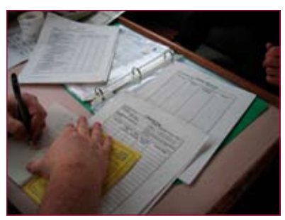
Have your permits, logs, and relevant paperwork organized and accessible for your employees as well as an Alaska Department of Environmental Conservation inspector.

Direct marketing of Alaska seafood is on the rise, and onboard processing can move seafood more directly from the fisherman to the consumer.