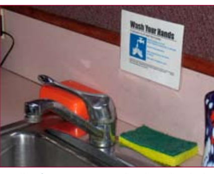
Food safety signage can be downloaded from the Alaska Department of Environmental Conservation Web site.

Again, you're handling a food product. You must have a hot running water source (109°F or higher) on your vessel for hand washing, and your system must achieve that temperature within 20 seconds. Paper or cotton towels used to dry hands after washing must be secured in a holder or rack. Once you've washed your hands, you don't want to be chasing a roll of paper towel all over the countertop, or worse yet, onto the floor.