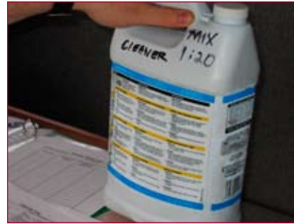
If you store your cleaners in smaller containers, label contents and ratios.

Cleaning detergents used in processing operations must be industrial/commercial/ restaurant grade. Household cleaning detergents—good-smelling cleaners—aren't allowed around food. Clorox-based detergents aren't allowed either. Once you've cleaned all surfaces, you'll need to rinse and sanitize them. Follow your sanitizer instructions for water-to-sanitizer ratios, and keep a supply of accurate sanitizer concentration test strips, or a test kit, on board. Think of these tools as your sanitation reality check! Record the readings in your daily sanitation paperwork.