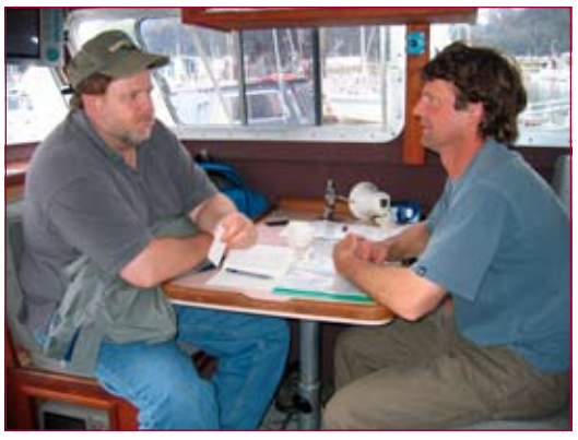
An Alaska Department of Environmental Conservation inspection provides an opportunity to ask health and food safety questions about new ideas you may have for your operation.