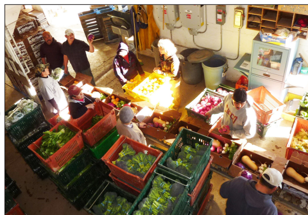
Packing CSA boxes, Full Belly Farm, Guinda, Calif.