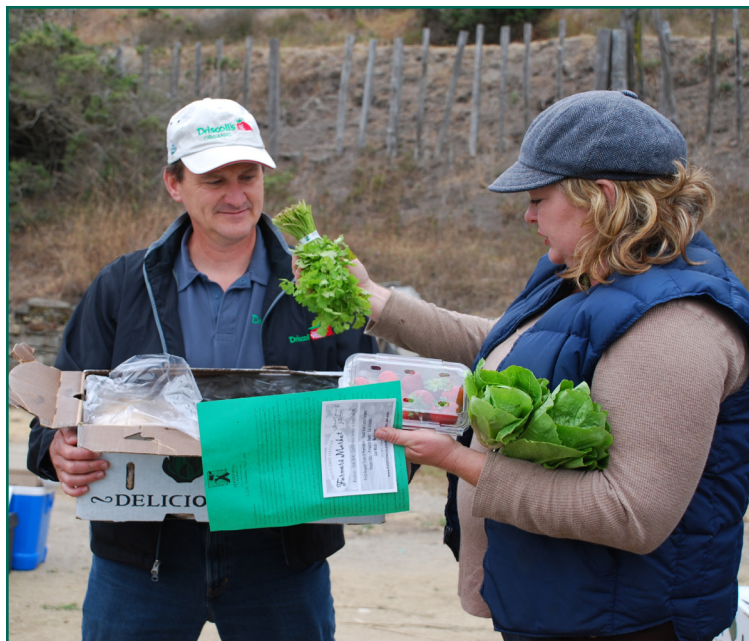
Serendipity Farm.